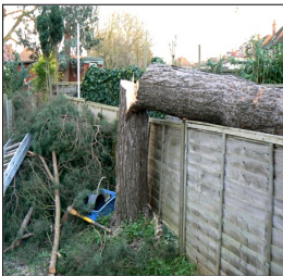
an illegally felled pine tree in the Sudbury Court conservation area. The tree fell across the neighbour's garden narrowly missing their house but damaging many beloved plants.

Some tell-tale signs: 'topping,' 'lopping' and 'trees expertly removed' are terms often used by unscrupulous contractors that are generally uninsured and certainly have no formal arboricultural training or knowledge.