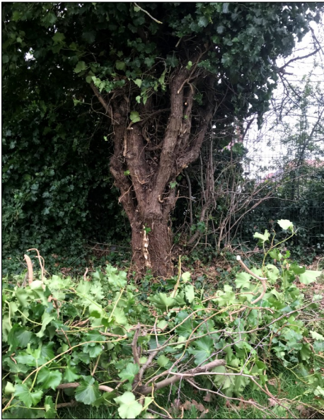
One of our happy trees after removing ivy Our front cover shows one of our groups of tree-saving guerrilla gardeners.

Over 2 consecutive weekends, 2 groups of residents turned up at The Pimple to remove ivy from our trees—ivy had killed one tree and threatens to strangle the life out of the rest of our trees there, including a large Oak (approx 250-300 years old). We 'saved' about 25 trees—in just 2 hours per weekend.