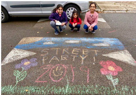
Never seen better use of a speed bump!