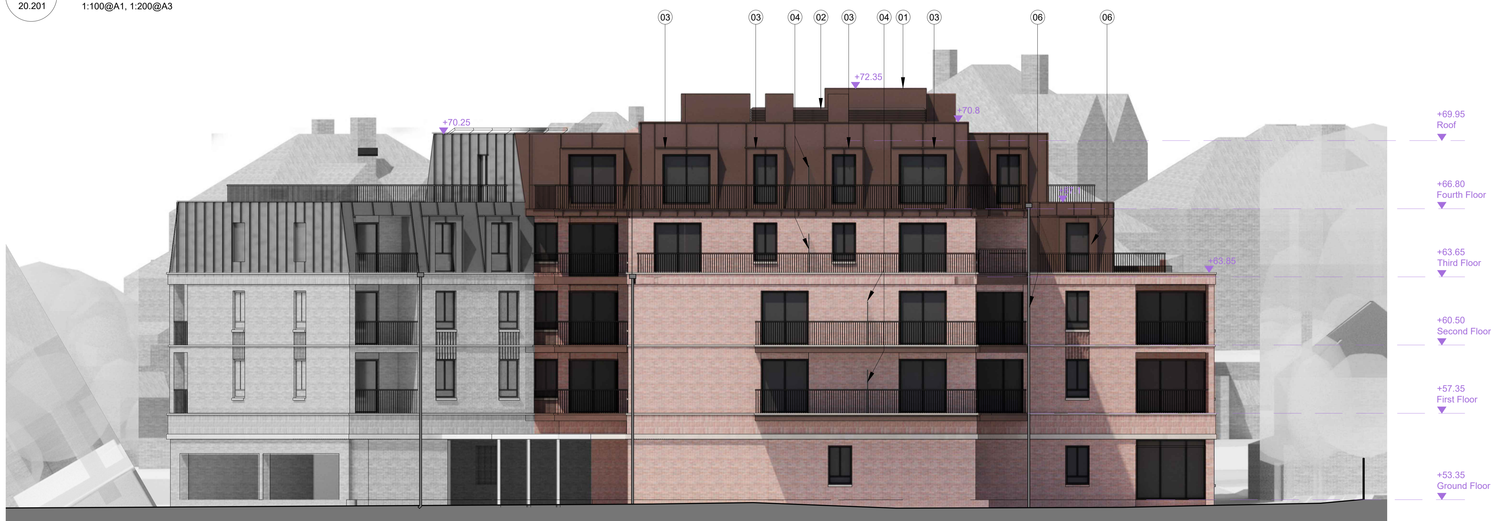
01 20.201 West Elevation A 1:100@A1, 1:200@A3

Garden | 231 Watford Road | Garden | 135 Sudbury Court