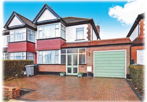
Carlton Ave West